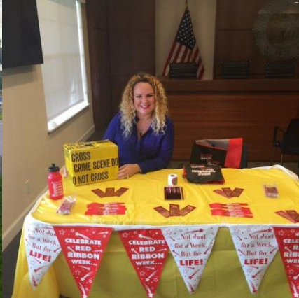
Drugs take back program.