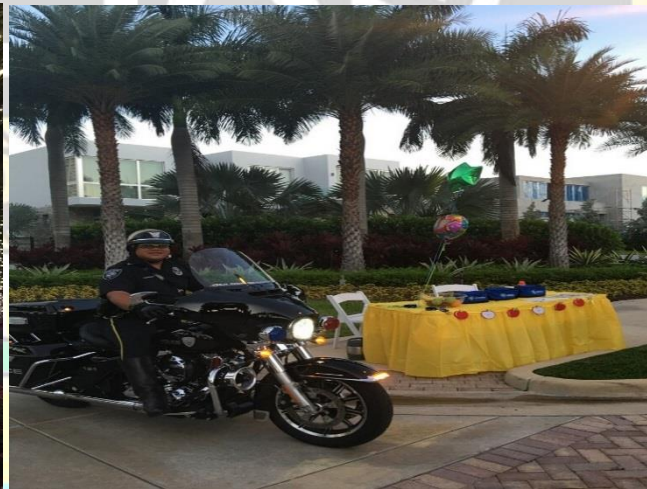
Back to school event, 2016