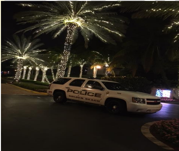
Golden Beach Holiday lights