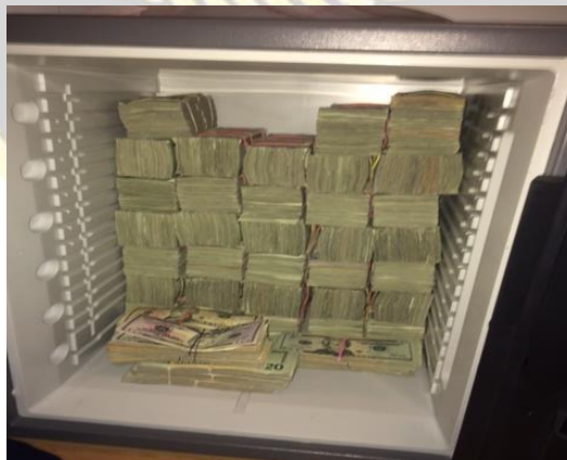
Task Force Seizure Money 2016