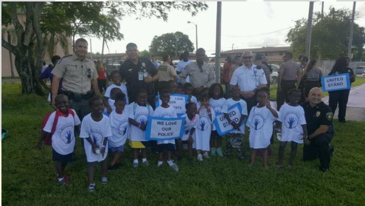
Liberty City Youth walk Police support.