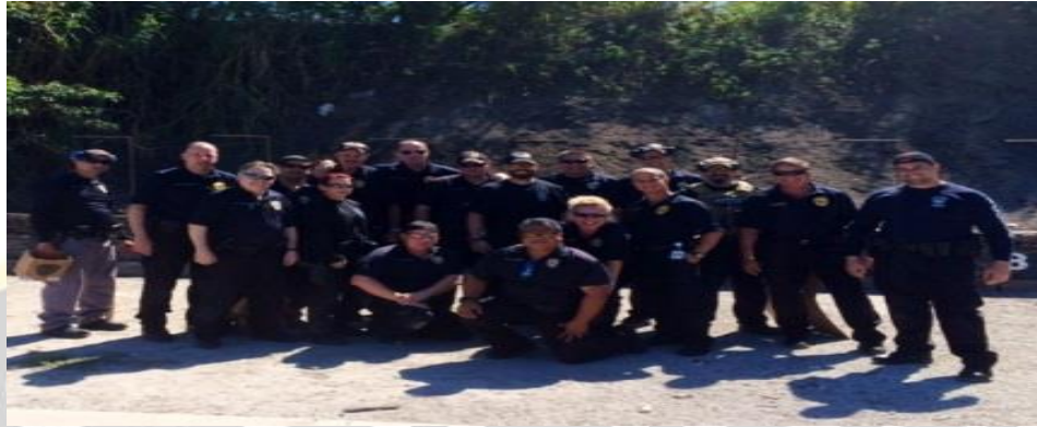
Annual Firearms Training, Medley Range.