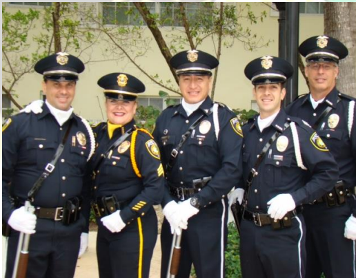
Golden Beach Honor Guard

The Administration Section is responsible for overseeing the services unit and ensuring professional compliance. Administrative Files, Internal Affairs Files, Training Files and Personnel Files are housed within the Administrative Section's office. The Executive Assistant to the Chief is the custodian of all police files and oversees the administrative function of the Chief's Office.