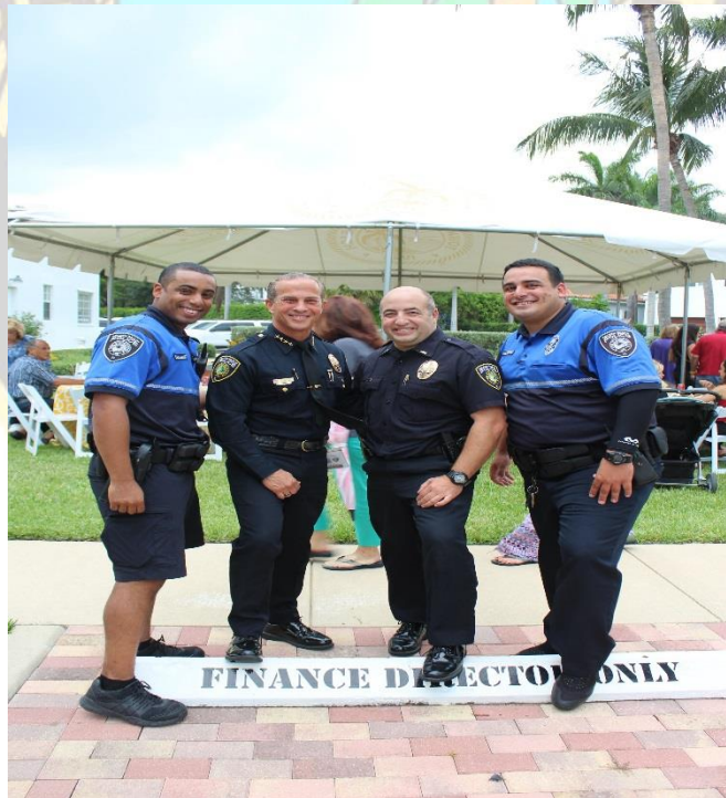
Town of Golden Beach 87 th Anniversary Event