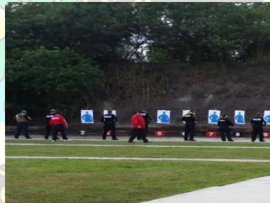
Tactical Firearms Qualifications