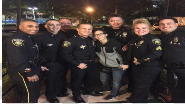
Officer swearing in ceremony, Golden Beach