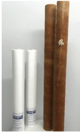
Before & After Filters, from a system installed in Golden Beach