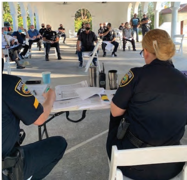
Ready to Protect and Service: GBPD Officers participate in Centralized Roll Call

Wear or use a broad spectrum sunscreen every day to protect your skin from the harmful effects of the sun. Apply generous amounts of sunscreen, especially when you are active outdoors. Use a water resistant sunscreen when swimming or sweating, and always choose a sunscreen that offers an SPF (sun protection factor) of 30 or higher.