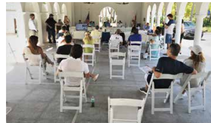
Residents Gather at the Beach Pavilion for the May 11th Fiber Internet Workshop

The project is underway and is scheduled for completion by mid-July. Currently, the site has been cleared of vegetation to accommodate the new bus shelters. The sites will be refreshed with new landscaping along A1A and furnished with beautifully designed bus shelters from Landscapeforms. The shelters will be self-sustaining, providing light powered by solar panels.