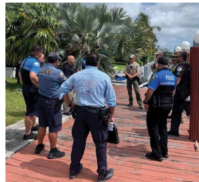
Keeping Waterways Safe: Marine Patrol strategy meeting

A lot of people think that keeping a hidden key is a safe and handy way to prevent getting locked out in an emergency. Unfortunately, this is not such a great idea. The reality is that criminals are aware of this practice and will often search for a hidden key before attempting another way into your home. It is also common for burglars to watch the activity around the homes they are casing. If they are scoping out your home, they may notice the key and exactly where you have placed it.