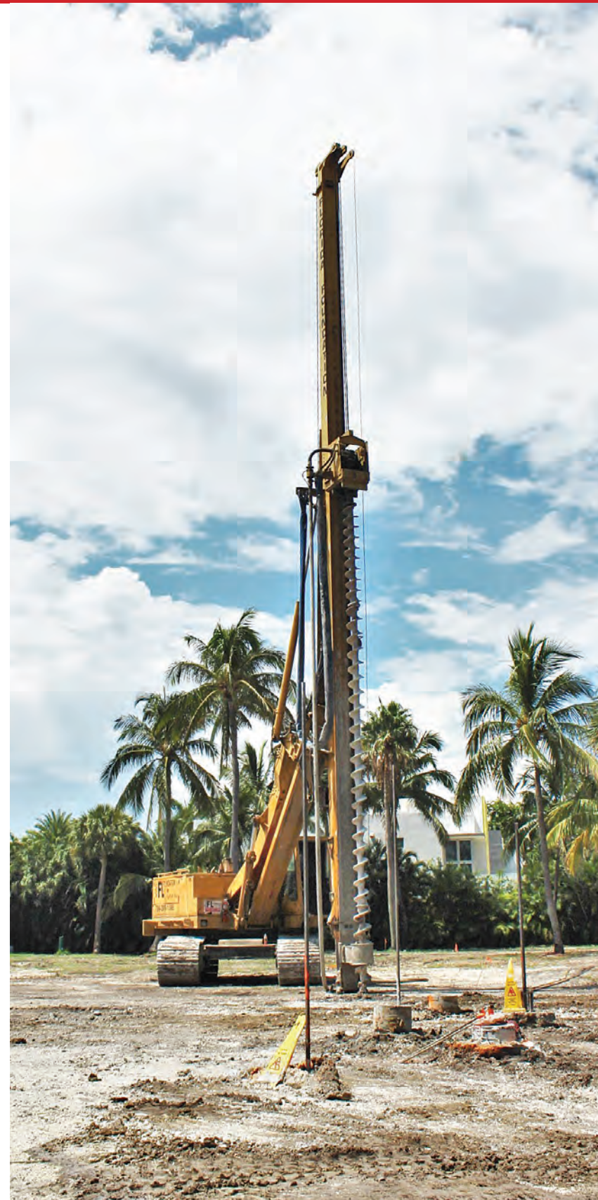
Piling drilling for the new Civic Center began in July.

The newly installed shower tower is ADA compliant and accessible to all our residents. It includes (2) shower heads and a foot spray.