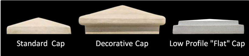
Column Caps Illustration

*Pictures shown are for illustration purpose only. Actual product may vary due to specific products ordered.