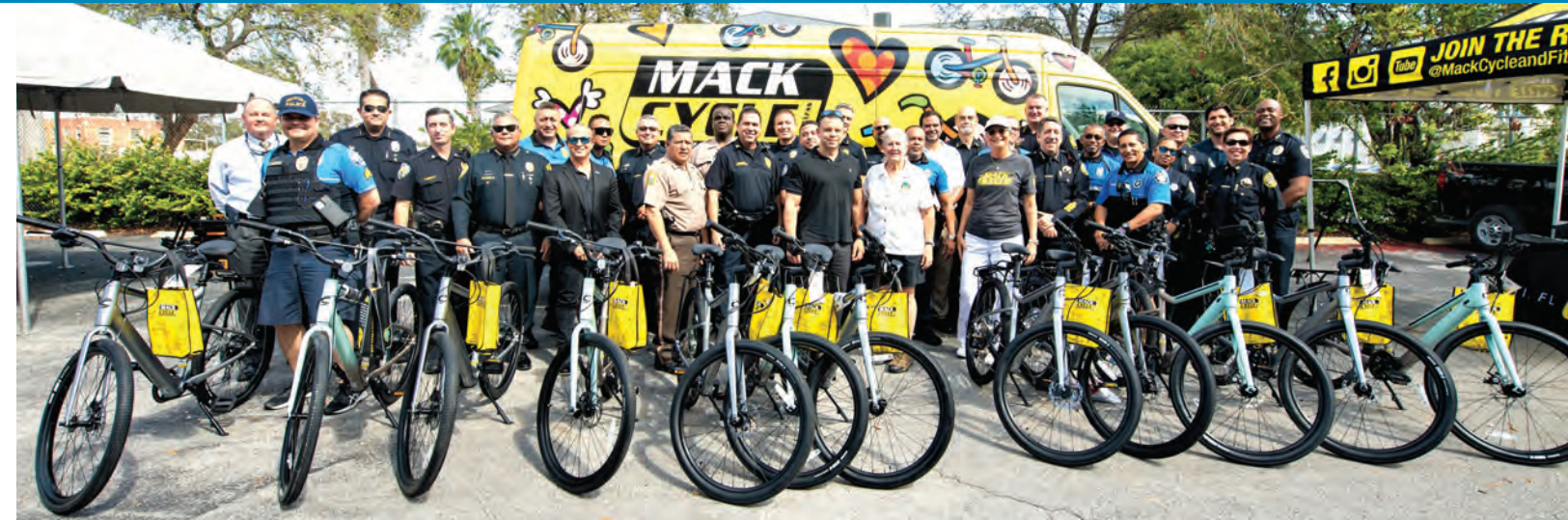
GBPD participates in County Commissioner Sally Heyman's Electric Police Bike Event

Some important safety reminders for residents to consider include: