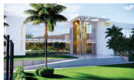
Exterior rendering of proposed Wellness Center