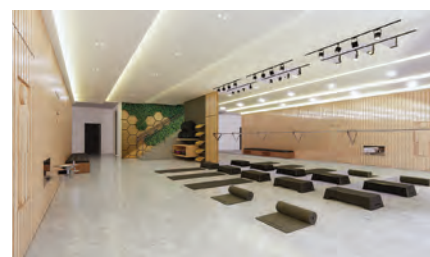
Rendering of proposed Wellness Center's yoga studio/fitness space