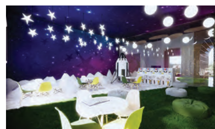
Proposed interior of youth recreation area