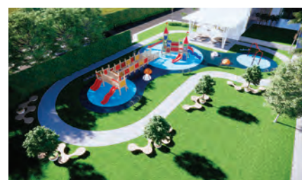
Overview of proposed playground