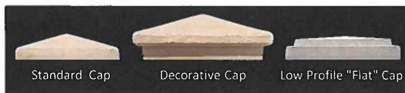
Column Caps Illustration

*Pictures shown are for illustration purpose only. Actual product may vary due to specific products ordered.