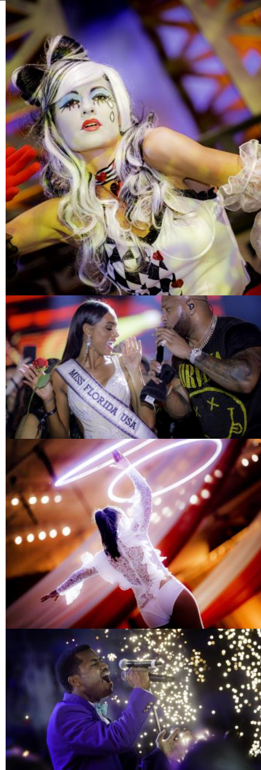
ABOVE: SCENES FROM THE 2018 MIAMI GALA

The fundraising goal for this year's Gala is $2.5 million in revenue from sponsorships, live and silent auctions.