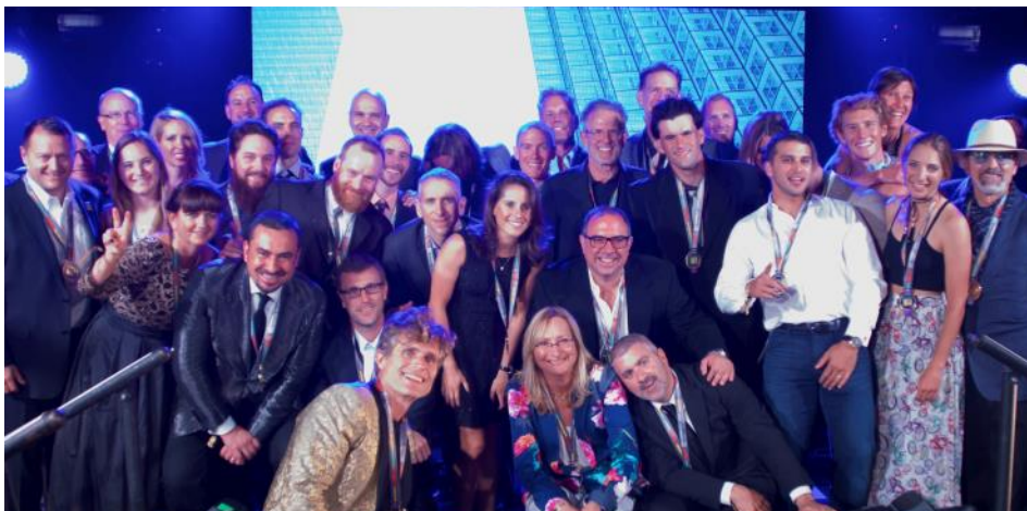
ABOVE: PARTICIPANTS FROM THE 2016 MIAMI CHALLENGE CELEBRATE ONSTAGE AT THE MIAMI GALA