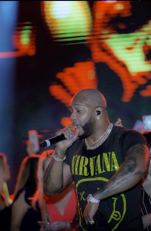
TOP: KESHA PERFORMS AT THE 2016 MIAMI GALA BOTTOM: FLO RIDA PERFORMS AT THE 2018 MIAMI GALA