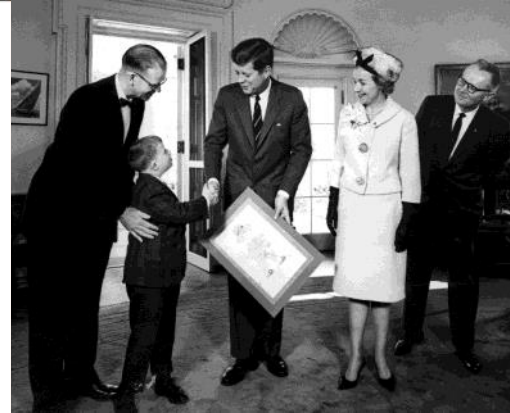
ABOVE: PRESIDENT KENNEDY WELCOMES A PERSON WITH IDD TO THE WHITE HOUSE