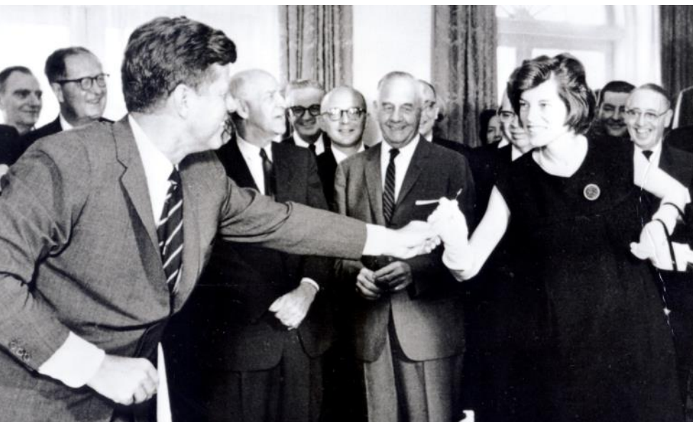
ABOVE: PRESIDENT KENNEDY PRESENTS A PEN TO SISTER EUNICE KENNEDY SHRIVER AFTER SIGNING MATERNAL & CHILD HEALTH & MENTAL RETARDATION BILL, THE WHITE HOUSE, OCTOBER 1963