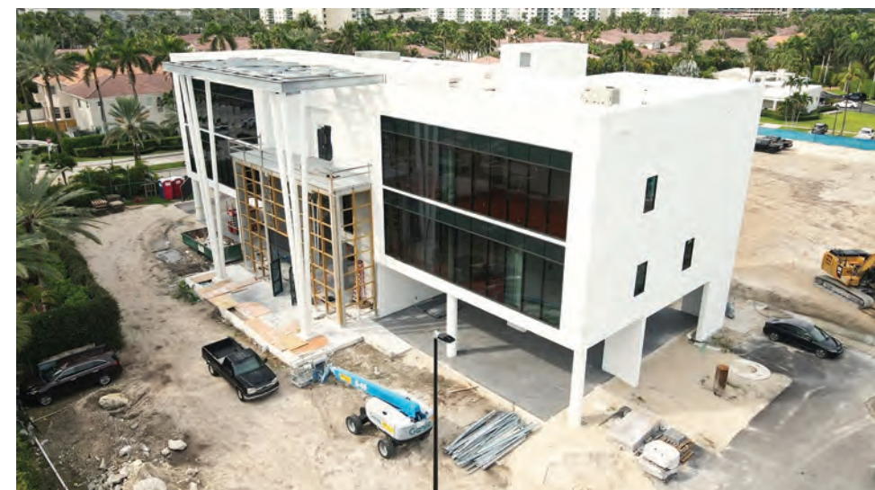
Windows are installed and work continues on the façade of the Civic Center.

The building is expected to receive its Certificate of Occupancy in November.