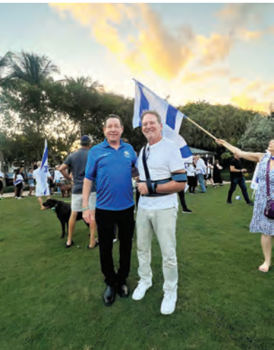
Aventura Mayor Howard Weinberg with Mayor Glenn Singer

In an effort to protect our residents from any potential dangers related to the conflict, the Golden Beach Police Department has increased security. We are also in constant communication with local and national law enforcement agencies to monitor any potential threats. We are committed to keeping you safe.