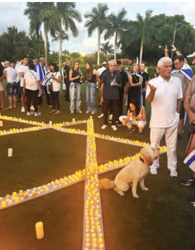
Golden Beach Residents gathered to show support of Israel

In a time where there appears to be a rising trend in crime, our focus is to expand the way we provide security needed to protect you and your property. I have created a safety video entitled Town of Golden Beach Public Service Announcement which can be found on the Town's website and on YouTube. It is imperative that as we seek to keep Golden Beach safe and secure, our residents do their part to protect themselves, their families, and their belongings.