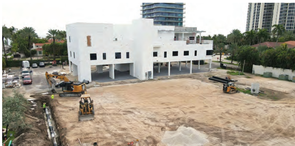
Earthwork is well underway for the amenities areas of Tweddle Park. This space will become new home of our Tennis Courts and Pickleball Courts.