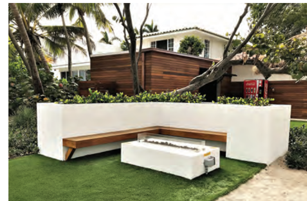
Fall Vibes Only: Celebrate Autumn by cozying up around our fire pit.