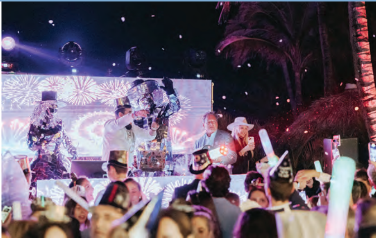
Our 95th year began with a "BANG!" at the New Year's Eve party at the Beach Pavilion.

With all these exciting projects in the works, it is important that we do not lose sight on the most valuable commodity in Town – your safety and security. It continues to be one of our top priorities, which is why one of the first things we are doing this year is adding emergency call boxes throughout 11 locations in Town. In addition, we are adding 208 additional closed-circuit tv cameras throughout Town this year and have increased patrols and police staff. The men and women in blue in the Golden Beach PD are working around the clock to protect our community and I am grateful for all their hard work and dedication to keeping our Town safe.