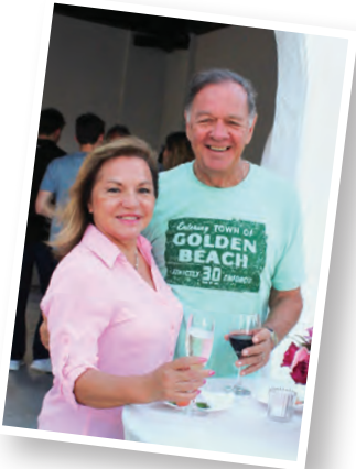
Town Council General Election, February 18, 2025

Tuesday, February 13 - Building Regulatory Meeting – Town Hall - 6PM***