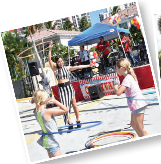
Valentine's Day at the Beach Pavilion, Wednesday February 14, 2024 5PM

Stay tuned for fun, celebratory programming befitting such a major milestone. Below are just a few things coming your way with new events being added soon!