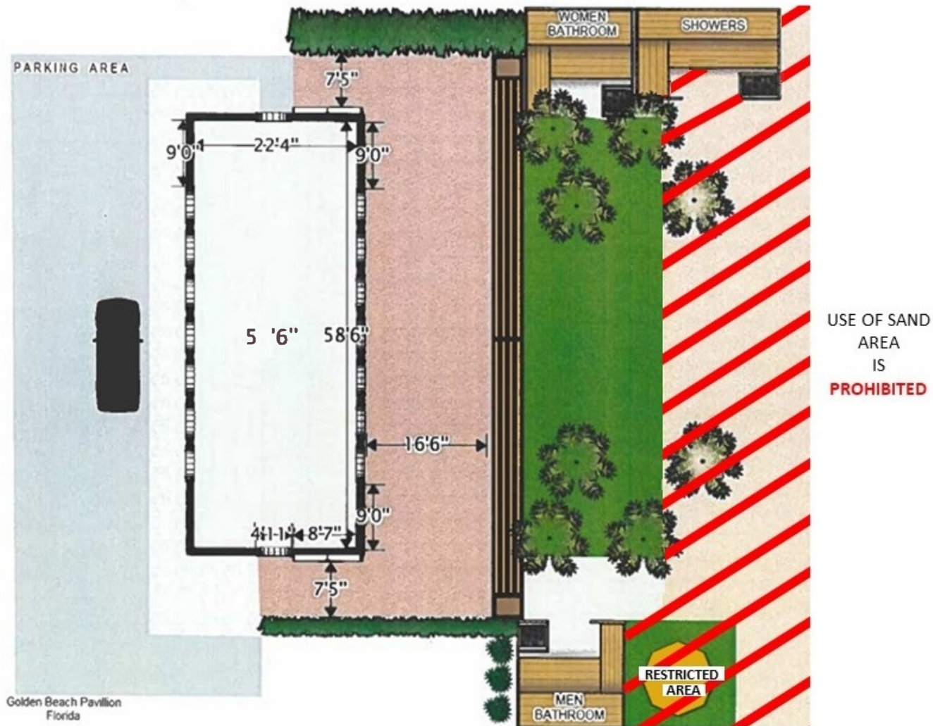
Golden Beach Pavillion Florida